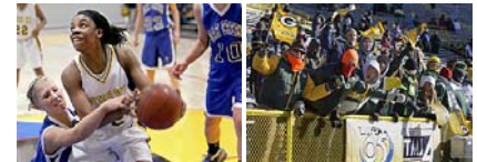
Girls basketball: Milwaukee Plus 51, Oak Creek 37